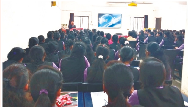
Compitative Exam Guidance Seminar