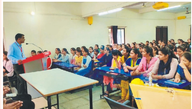
Gurupurnima Principal Guidance