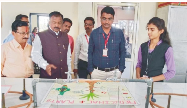
Poster Presentation Competition