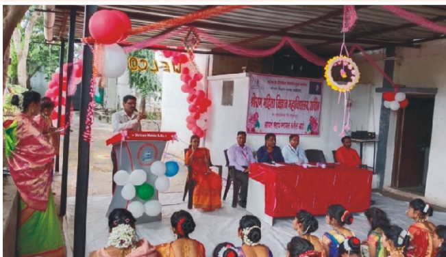
M.Sc. Welcome Function Celebration