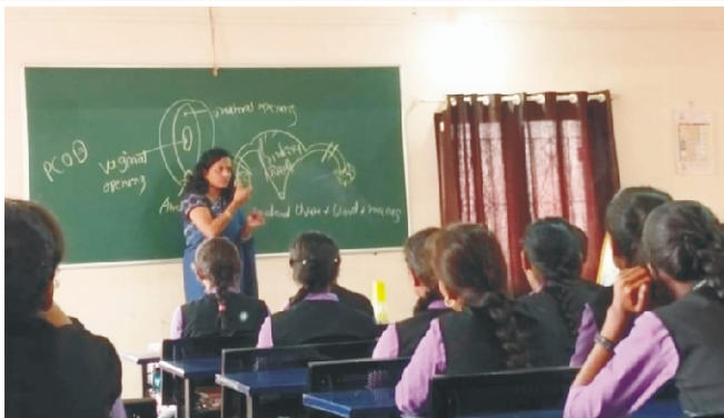
Aids Awareness Lecture