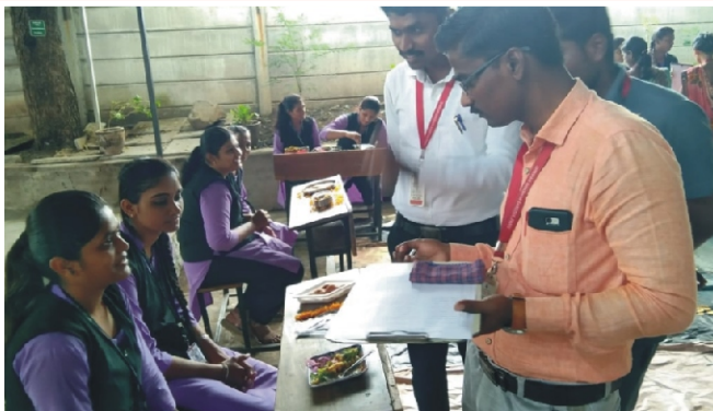
Kitchen Queen Competition