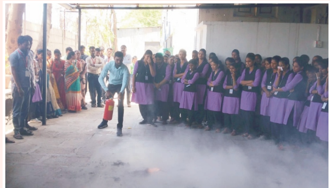
Fire Extinguisher Training

For more details contact us : 7262977055, 9921864464, 9545243000, 9665831258