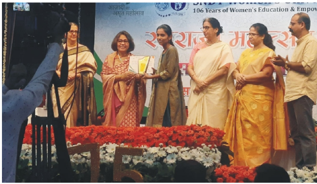
Poetry Writing Second Prize University Level