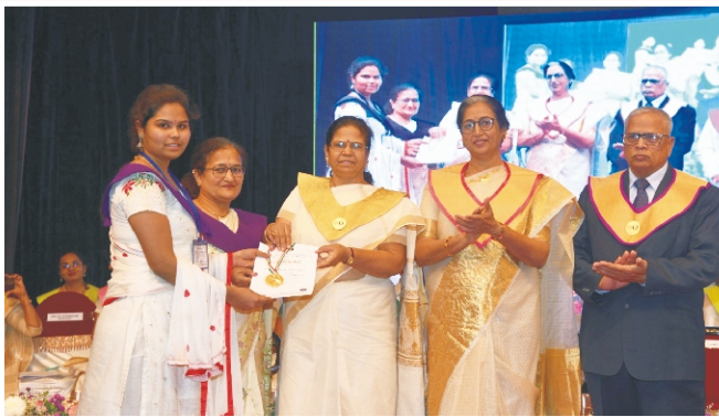
University Gold Medal (PG Analytical Chemistry)