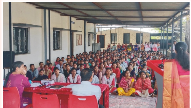
Health Guest Lecture

For more details contact us : 7262977055, 9921864464, 9545243000, 9665831258