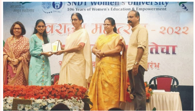
Essay Writing Second Prize University Level