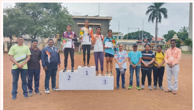
High Jump Gold, Bronze Medal

For more details contact us : 7262977055, 9921864464, 9545243000, 9665831258