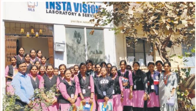
Instavision Satara (M.Sc.I)