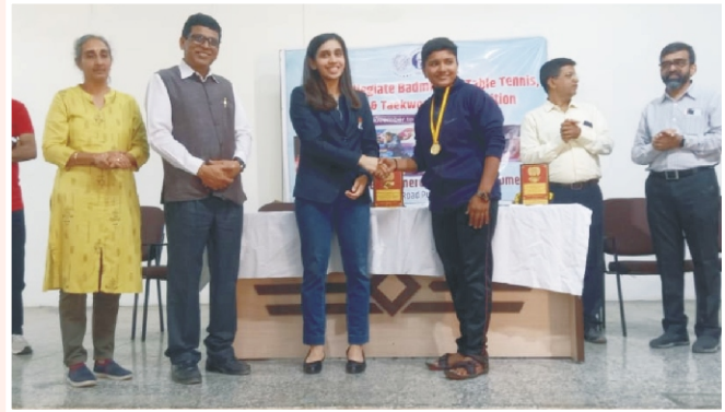
Wrestling Gold Medal