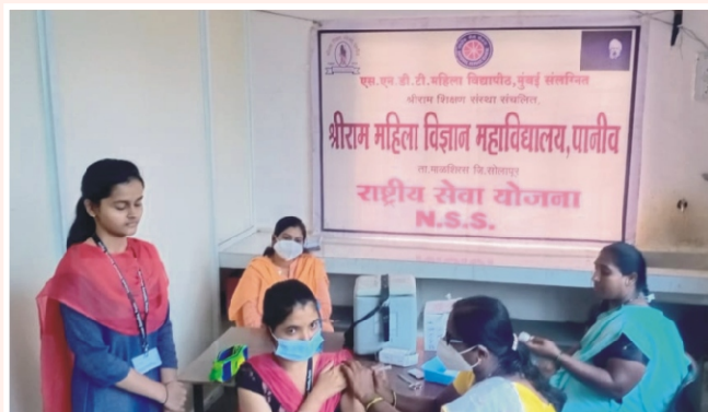
Student Health Checkup Camp

For more details contact us : 7262977055, 9921864464, 9545243000, 9665831258