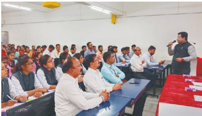
IPR & RM One Day State Level Seminar