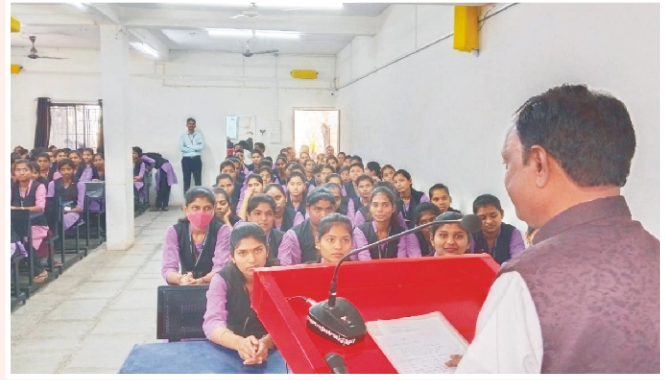
National Science Day Guest Lecture