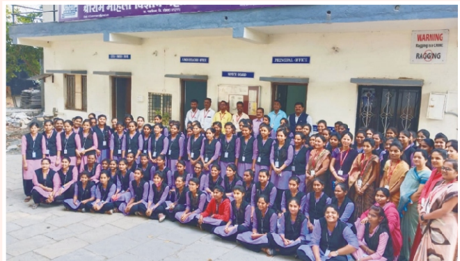
Certificate Course Guest Lecture

For more details contact us : 7262977055, 9921864464, 9545243000, 9665831258