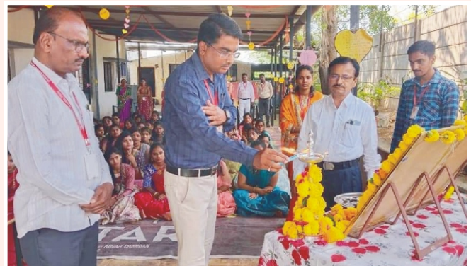
B.Sc. Farewell Function