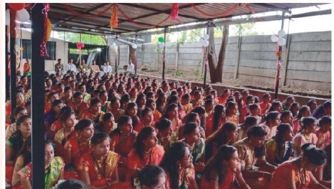
B.Sc. Welcome Function Celebration