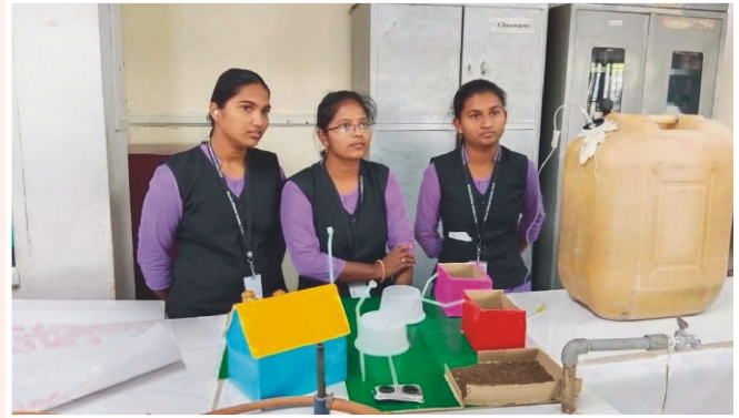
National Science Day