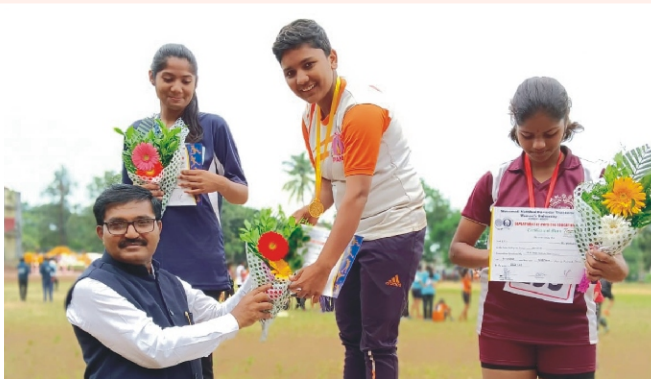
Disc Throw Gold Medal