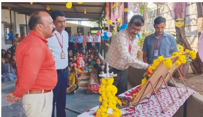
M.Sc.II Farewell Function