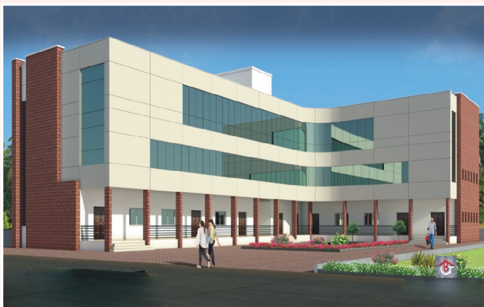
Proposed College Building

For more details contact us : 7262977055, 9921864464, 9545243000,9665831258