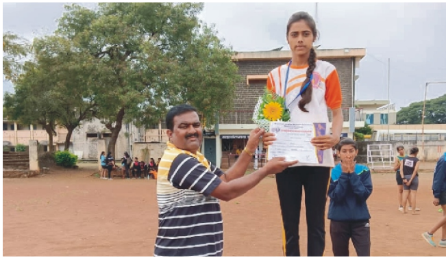
Long Jump Silver Medal