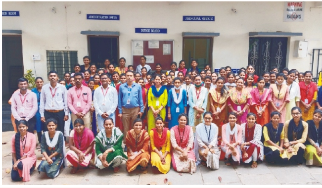
Skill Development Three Day Workshop