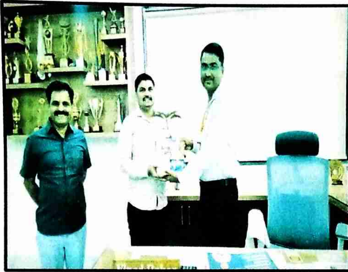
Felicitation of Guest