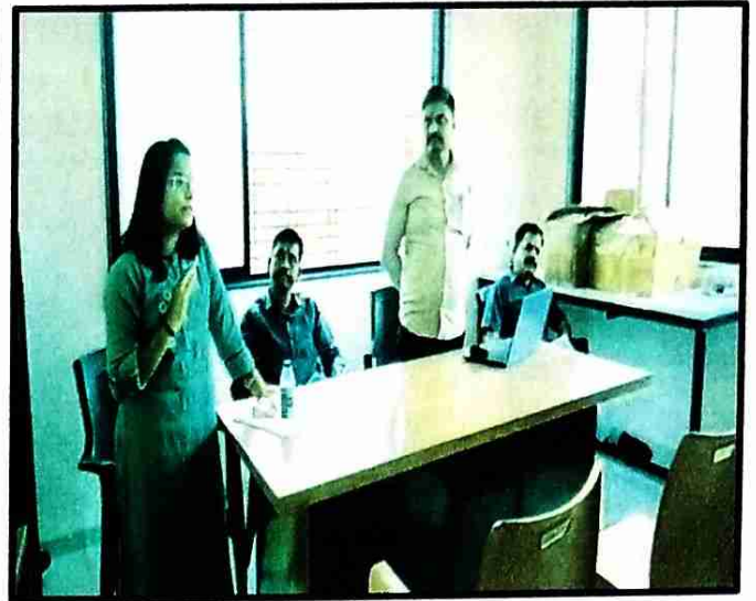
Alumna interact with students