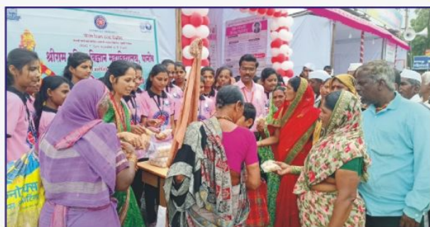
Food Donation at Palakhi Sohala