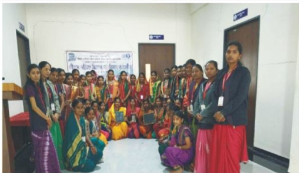
Adolescent Girl's Day