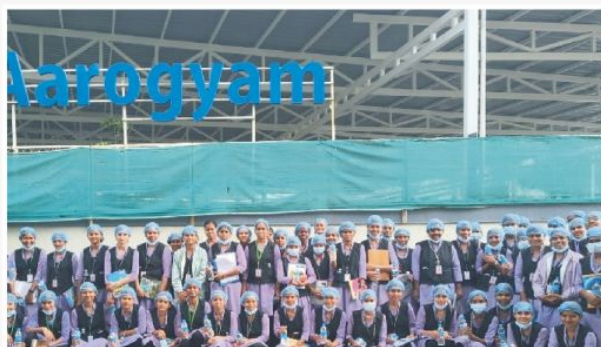
Aarogyam Mineral Water Plant, Akluj