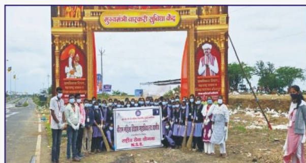
Cleaning Activity (NSS)