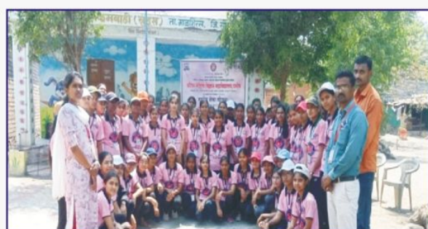
NSS Special Camp