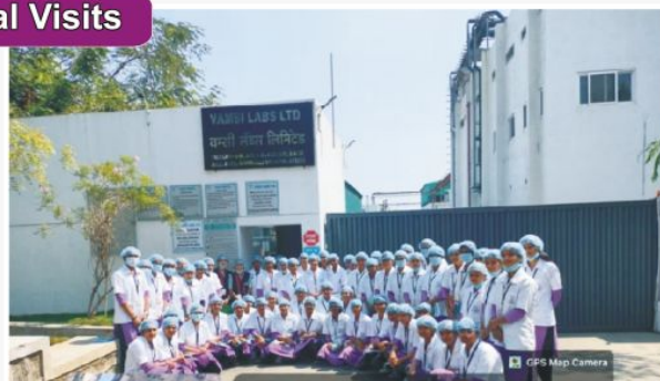
Vamsi Lab, Chincholi, Solapur