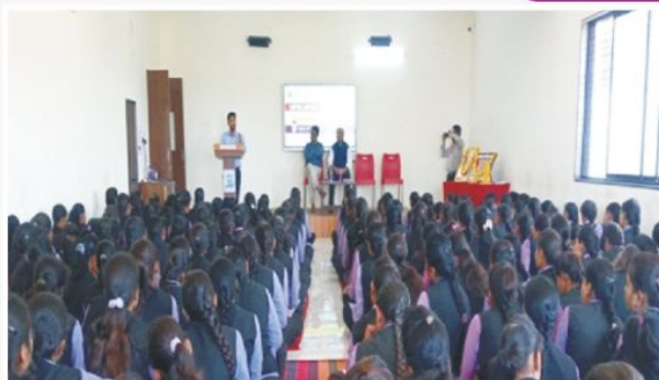
Competitive Exam Preparation Guidance Seminar