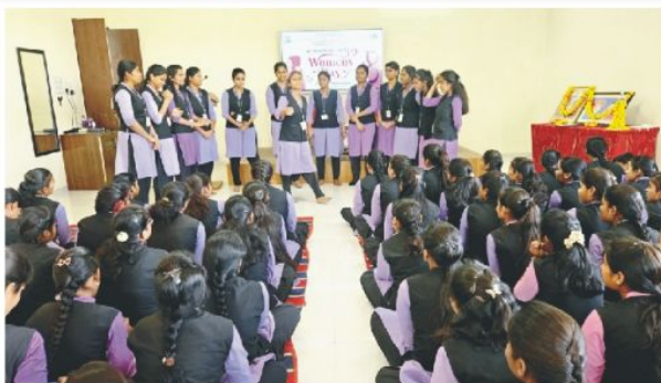
International Women's Day- Street Play