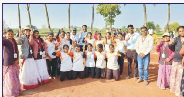
Kabaddi – Championship