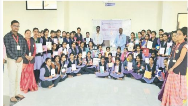
Greeting Card Competition