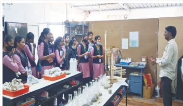
Soil Testing Center, Velapur