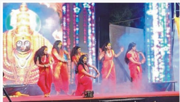
Sarthak 2025 Gathering