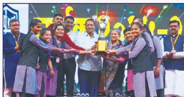
Sports General Championship Winner 2026