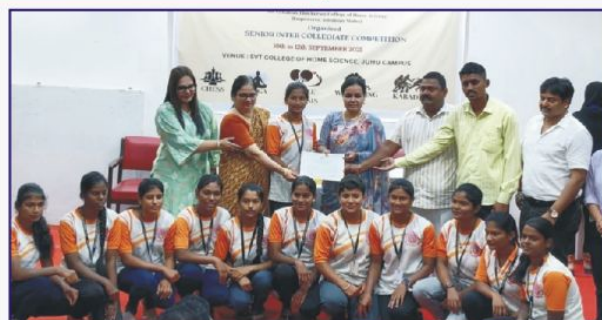
Kabaddi & Volleyball Competition- 4 th Place