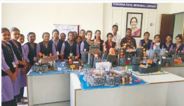
Fort Model Making Activity